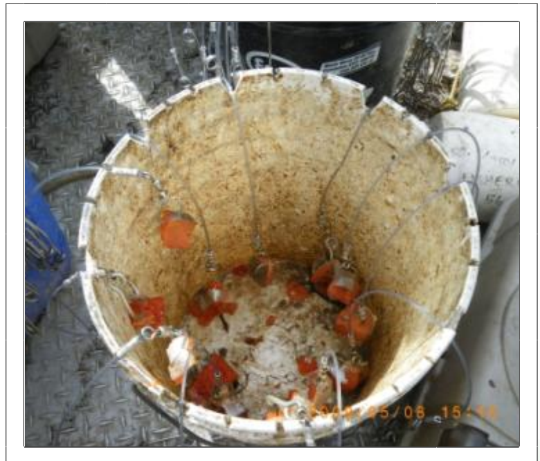
Set lines with Sockeye bait.

As with previous year's work, 2008 was again a very successful year, with a total of 70 sturgeon captured during the brood program. Sixty-two adults and 8 wild juveniles were caught and tagged between April 29 and May 31. Thirty-four of these fish were recaptures and 36 were previously not caught. A total of six ripe females and four ripe males were captured, and of these fish caught, five females and four males were transported to Prince George for spawning. Of these nine fish, four females and three males were used for the conservation fish culture program. Twenty new radio transmitters were applied to track both wild sturgeon spawners and untagged sturgeon used in conservation fish culture.