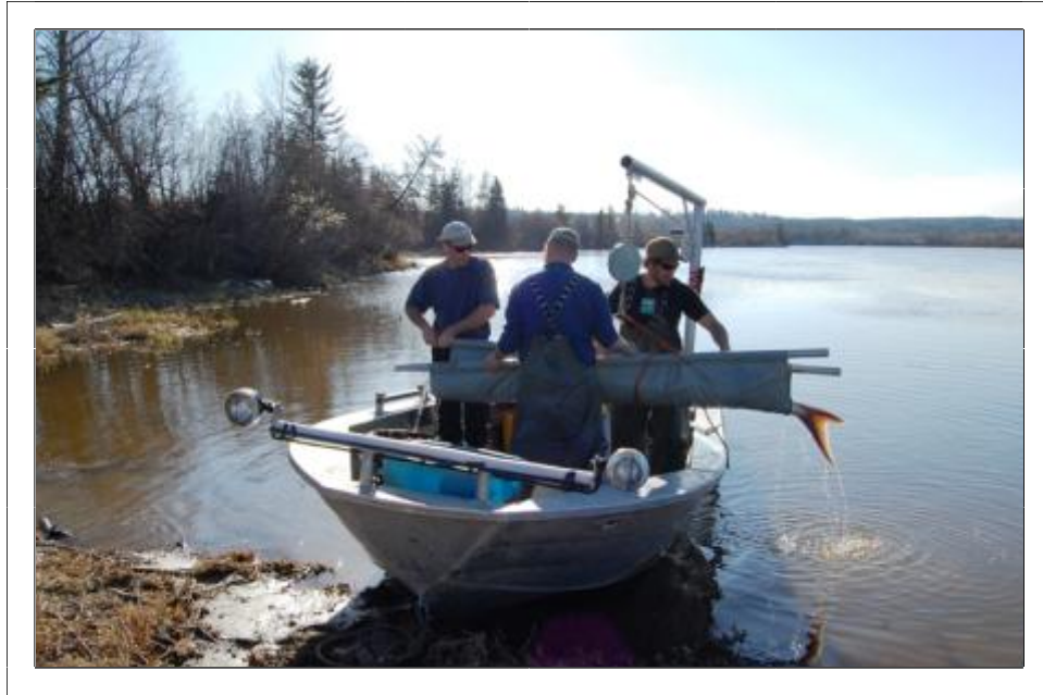
Adult sturgeon being assessed as potential 2008 broodstock.

From 1994 to 1999, the Province of British Columbia coordinated an intensive study of white sturgeon in the Nechako River. The study came to an unwelcome conclusion - the Nechako white sturgeon are in a critical state of decline. Unless something is done, and done soon, these great creatures will become extirpated.