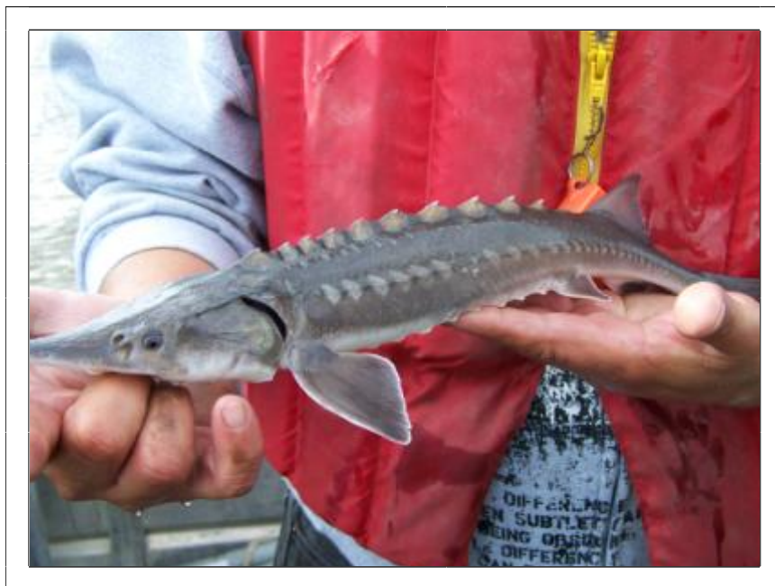
Raised as part of the 2006 conservation fish culture program, this juvenile was recaptured in the fall of 2008.

A total of 5 white sturgeon were captured ranging in length from 34cm to 103cm (total length). One of these fish was a conservation fish culture-reared juvenile that had been released in the fall of 2006. This was the first recapture of a fish culture-reared juvenile and the fish appeared very healthy at 49cm in length and just under 400g. A total of 5 of the 29 acoustic tags implanted in fish culture-reared juveniles released in the fall of 2007 were detected in the summer of 2008.