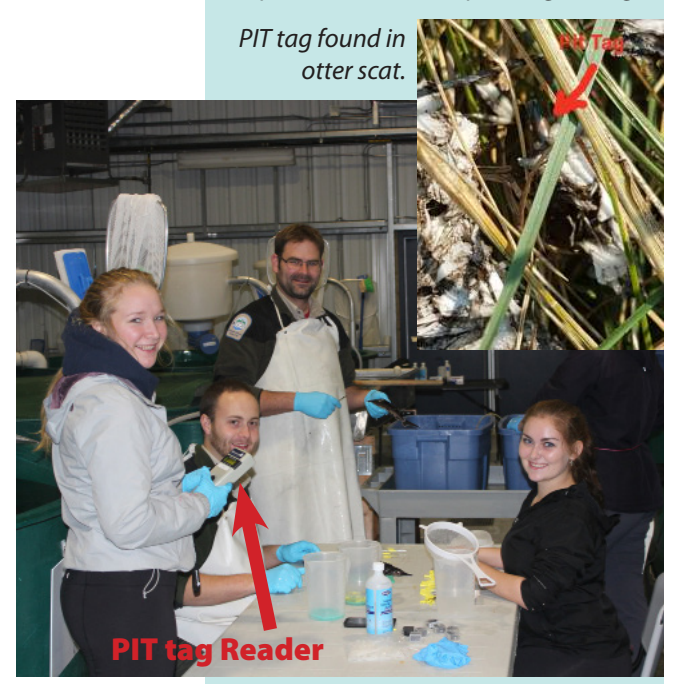
Tagging juvenile sturgeon.